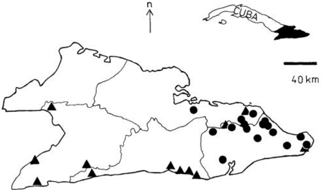
FIG. 3. Distribution of two species of Anolis in eastern Cuba. Localities for A. alayoni (circles) are (from west to east): Farallones de la Italiana (Sierra del Cristal), Sumidero del Ric Cuzco (western Meseta del Guaso), España Chiquita (Sierra de Canasta), Culebra de Hacha (Cuchillas de Mea), Piedra la Vela (Cuchillas de Tea), Cayo Fortuna (Cuchillas de Toa), Riita (Cuchillas de Toa), Cayo Cuan (Alturas de Baracoa), 3 km E de la Melba (Cuchillas de Toa), Arroyón (Sierra del Purial), Base de Monte Iberia (Alturas de Baracoa), Aserría Nuevo Mundo (Alturas de Baracoa), Nibujón (Alturas de Baracoa), Nibujón and La Florida (Alturas de Baracoa), Sabanilla (Cuchillas de Baracoa), Boca del Yumuri y Gran Tierra (Meseta de Maisí ). The localities of A. angusticeps (triangles) are: San Ramon, Bajada del Pesquero de la Alegría (Meseta de Cabo Cruz), Finca La Bahía, Pico Turquino, La Mula, 4 km W del Uvero, Santiago de Cuba, Playa Siboney, Playa Jaragua, Sardineró, Cuchillas de Guajimero, 9 km SE Mea, Ovando Arriba.

la Vela a Culebra de Hacha, and Cayo Guan, were collected in very dry vegetation associated with Pinus cubensis , termed "Char-rascal." These animals were perched on twigs and tree trunks at about the same height. The specimens from Arroyón were collected on twigs very close to the river in secondary rainforest. The same situation was observed for specimens from La Melba, Rio Cuzco, and Farallones de la Italiana. Animals collected at El Molino were sleeping on twigs at night several meters above ground next to a small stream.