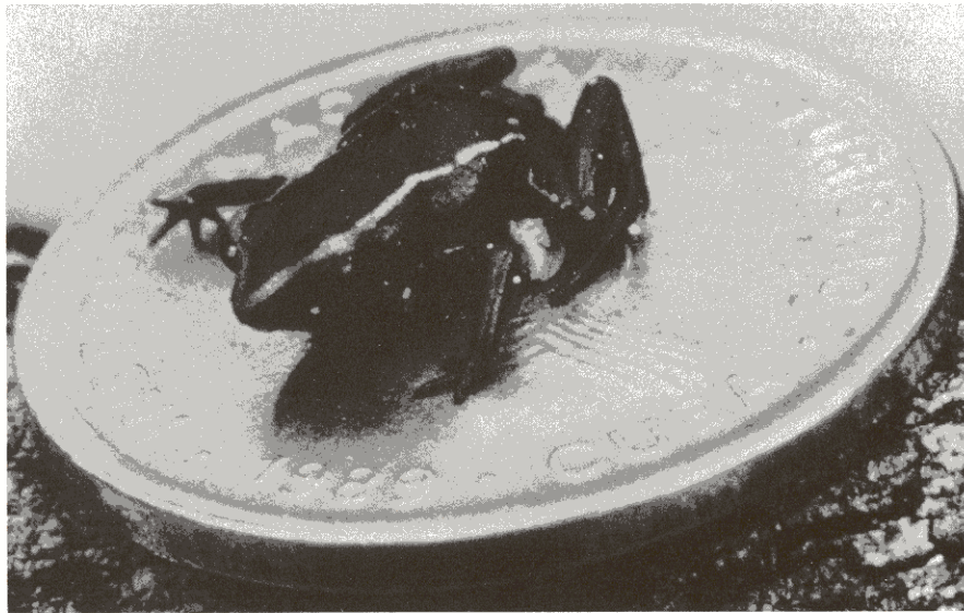
Fig. 1. Eleutherodactylus iberia , an adult male from Arroyo Sucio (Anacleto) Arriba, on the western slope of Monte Iberia, Holguín Province, Cuba, 600 m, collected by A. Estrada on 19 April 1993; photographed on a Cuban 10 centavos coin (21 mm diameter).